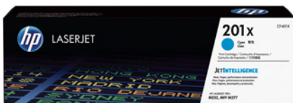
Original HP Toner cartridge with JetIntelligence

Original HP Toner cartridges with JetIntelligence give your business more pages, 3 peak printing performance, and the added protection of anti-fraud technology—something the competition can't match.